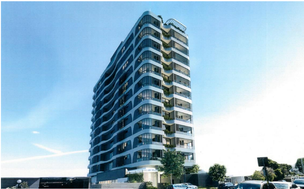
Development Approved Project Design