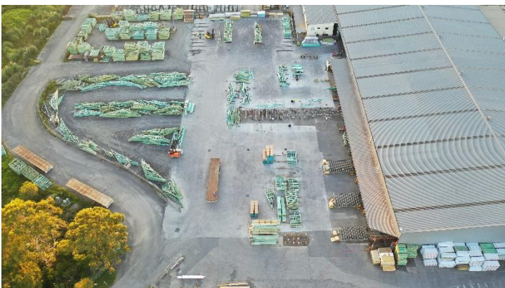
Warnervale Property – industrial land