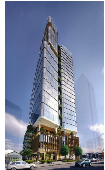
Conceptual Commercial Design